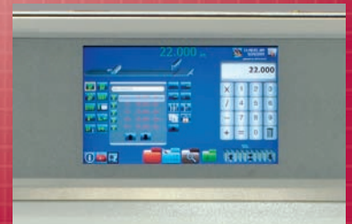
microcut™ Computer Control